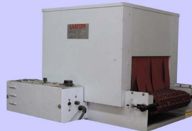
200 Channel Testing Station